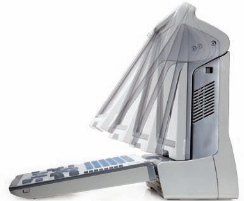
Tilting LCD display allows easy viewing