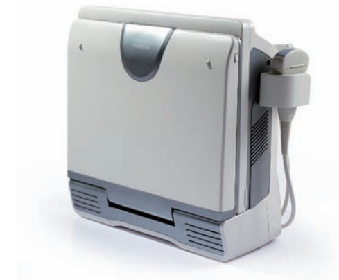
Compact and lightweight for enhanced mobility