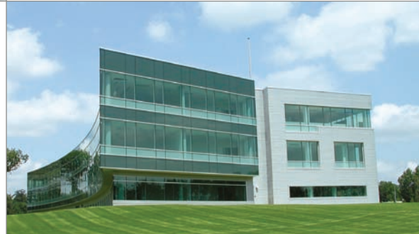
Mindray DS USA, Inc. U.S. headquarters in Mahwah, NJ

Mindray DS USA, Inc. 800 MacArthur Blvd., Mahwah, NJ USA 07430 Tel: 1.800.288.2121 or 201.995.8000 Fax: 1.800.926.4275 www.na.mindray.com